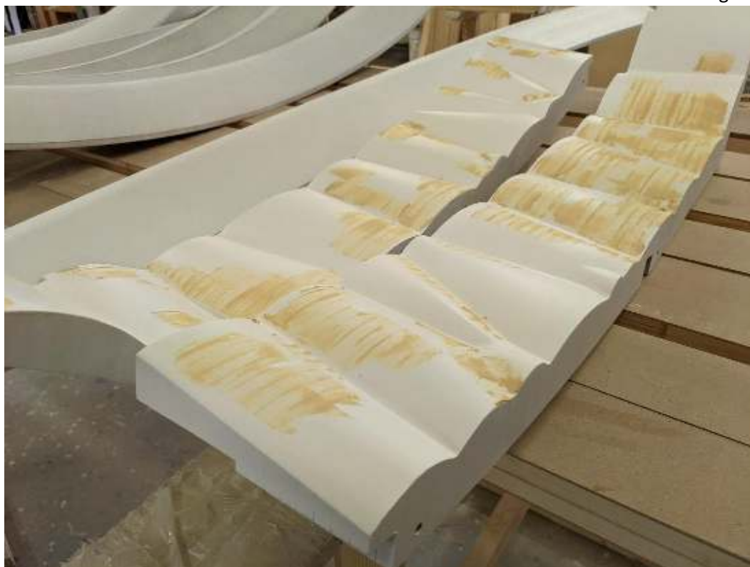
- First layer of lacquer and additional filling