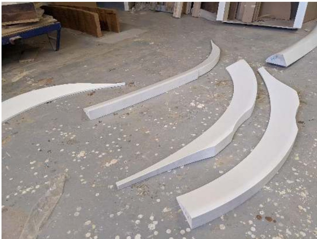
- Ceiling parts first layer of lacquer and rough sanding