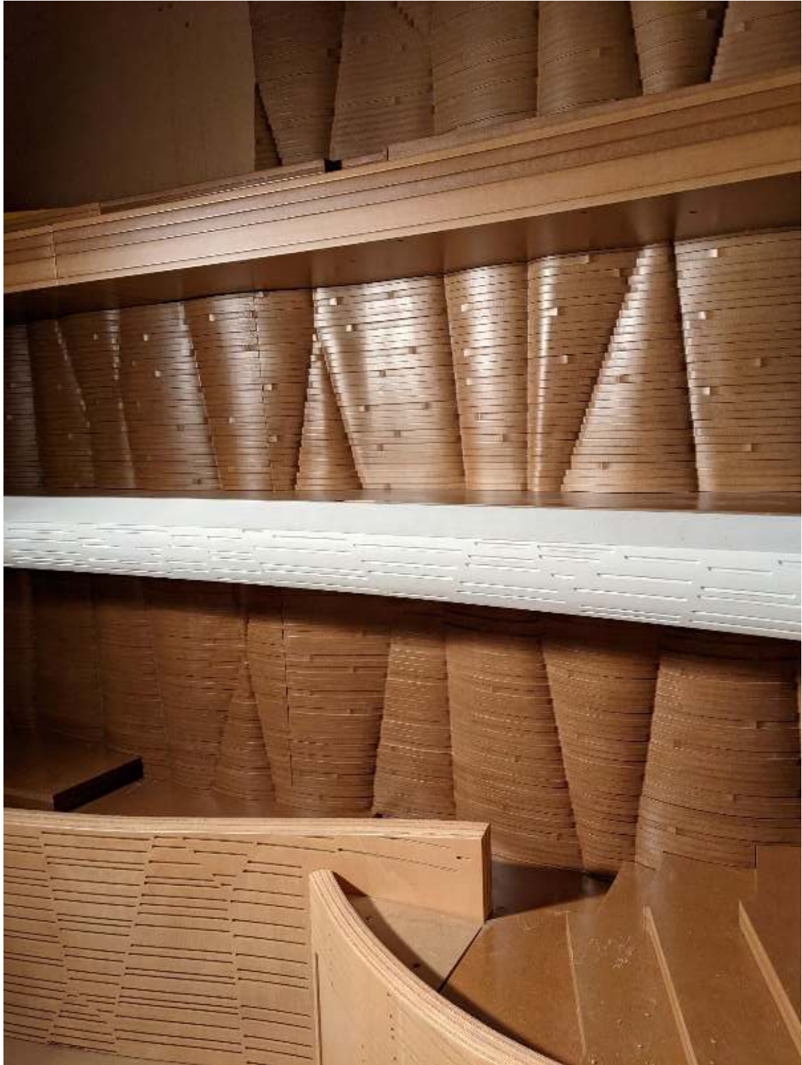
- fitting first layer of wedge between curved walls