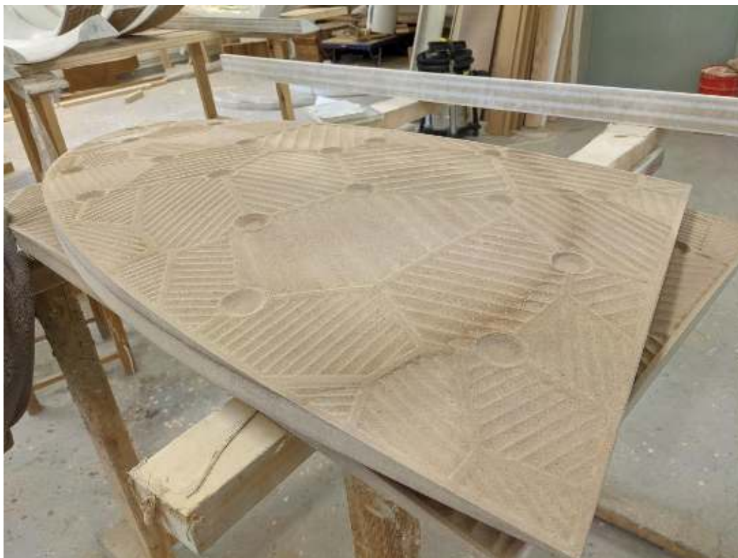
– Rough part from CNC