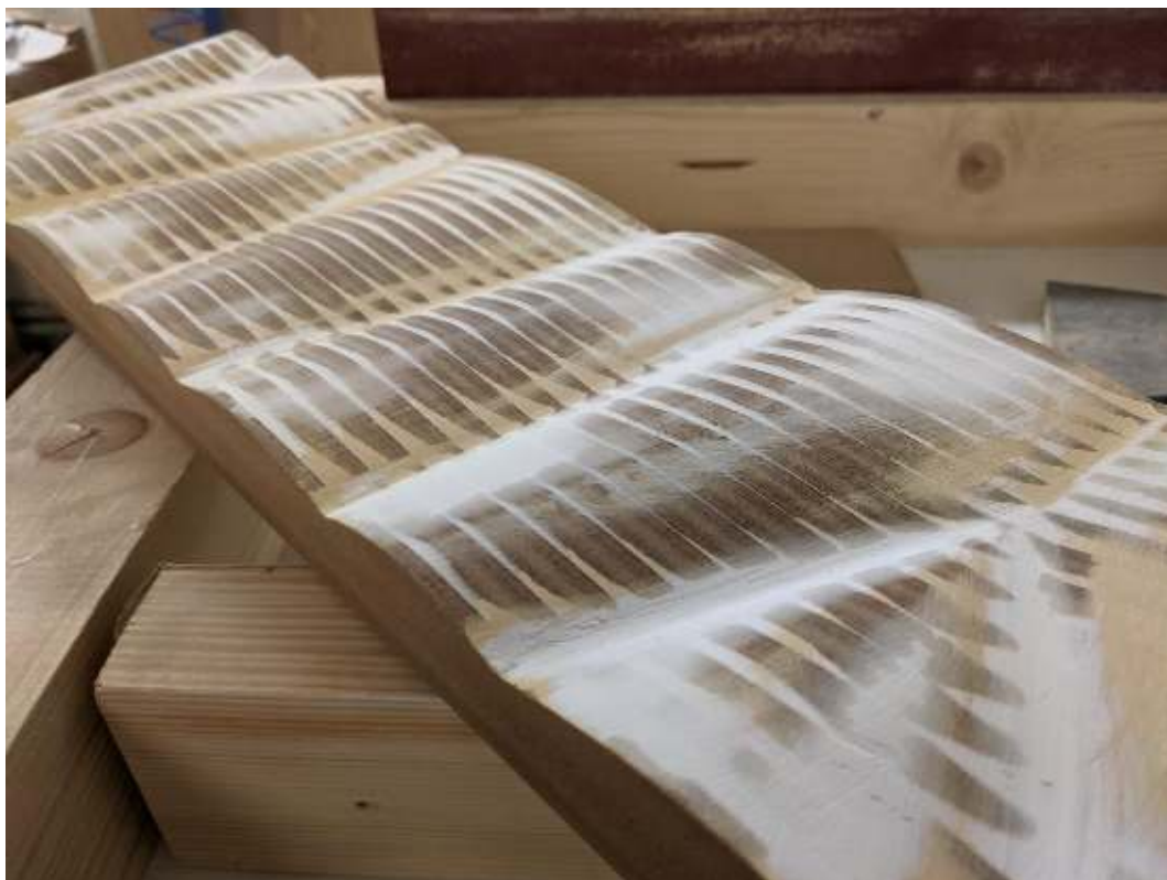
- first sanding and filling