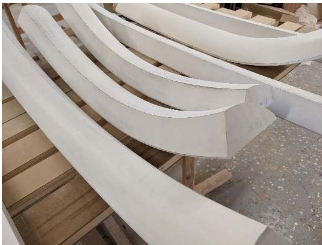
- balcony parts first layer of lacquer and rough sanding