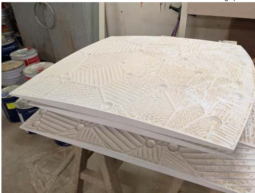
- First layer of lacquer and additional filling